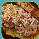
3. Canned/ Pouched Tuna